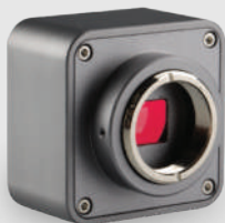
DIGITAL IMAGING CAMERA